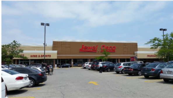
Oak Mill Plaza